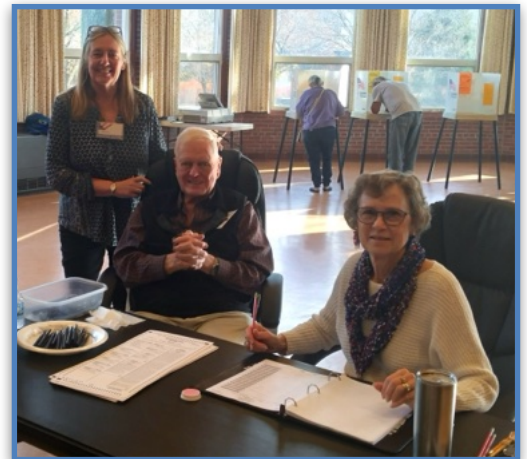
Smiling faces ready to greet voters and make the voting experience as seamless as possible .