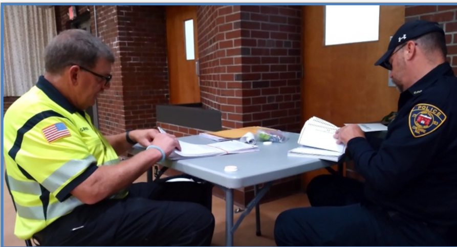
When the polls close, everybody has a job and takes it quite seriously. Time to count and tally. The day doesn't end when the doors close.